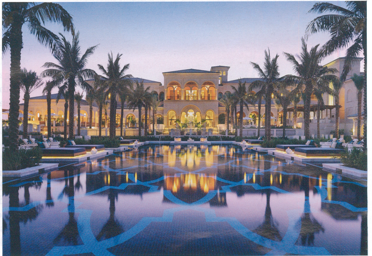
Above: the new One & Only The Palm resort in Dubai. Below: Ai Fiori restaurant at The Setai Fifth Avenue, New York.

→ In the Mexican colonial town of SAN MIGUEL DE ALLENDE artistic pursuits are a 24/7 affair, with conferences and festivals punctuating the calendar monthly. The Rosewood San Miguel de Allende ( www.rosewoodhotels.com ; from $295), a new-build puebla-style resort, endeavours to blend – cotto floors, hand-carved furniture and all – with its picturesque surroundings, and looks set to succeed in